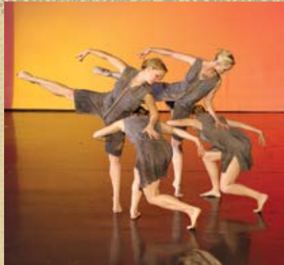
SpectorDance Company