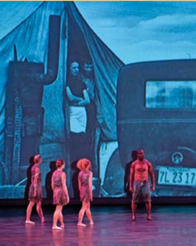
SpectorDance Company