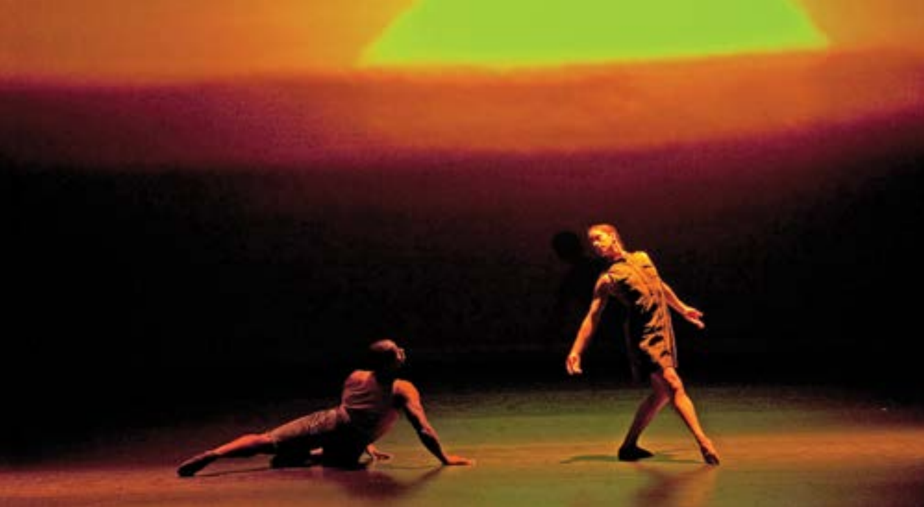
SpectorDance Company

SpectorDance is honored to join with the National Steinbeck Center to celebrate the 75th anniversary of The Grapes of Wrath , John Steinbeck's Pulitzer Prize winning novel. Figures in the Dust is a creative interpretation of this timeless and timely novel. Although this story takes place in California in the 1930's and describes the issues of the Dust Bowl Era and the Great Depression, the themes from the novel are relevant today. Key themes include the despair over loss of land and how this impacts one's identity, the power of community, the necessity for meaningful work, and the human capacity to overcome obstacles, create change and survive. Figures in the Dust blends spoken words from the novel, historic visuals from the Steinbeck library, music, and movement to create a compelling work that is both educational and entertaining.