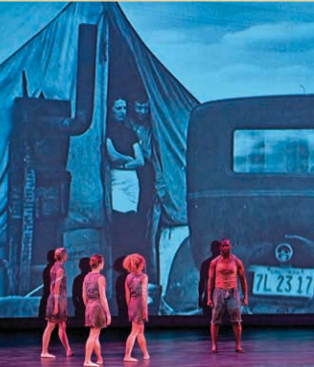
need names